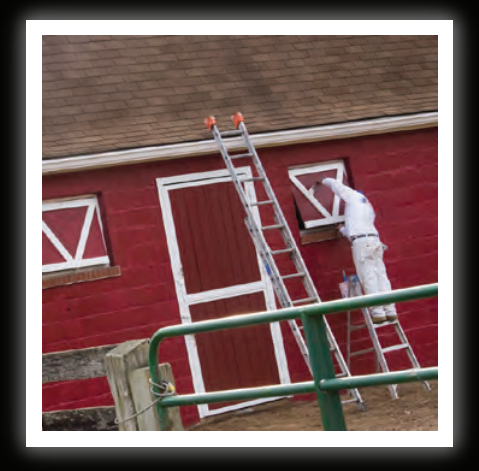
Campus Farm Makeover