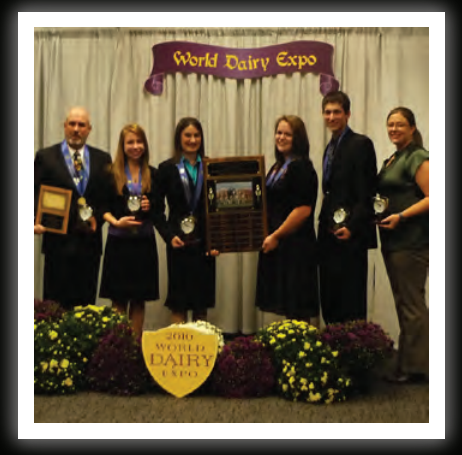
Maryland 4-H Team 2010 National Champions